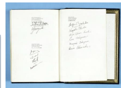
Treaty of Peace with Japan in 1951